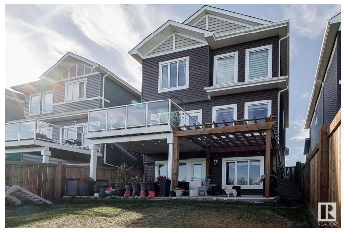
880 Ebbers Cres NW, Edmonton, AE