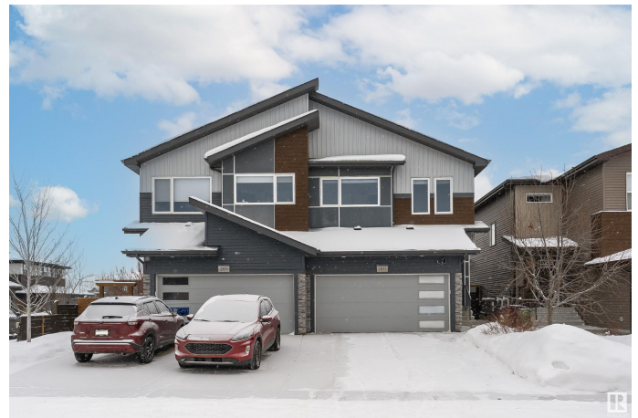
2833 Koshal Cres SW, Edmonton, AB

Main Floor Exterior Area 108.260 m 2 Interior Area 63.211 m 2 Excluded Area 38.36 m 2